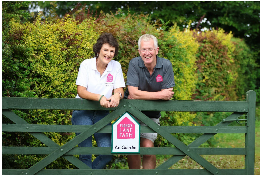
Image that Represents Our Business and Place